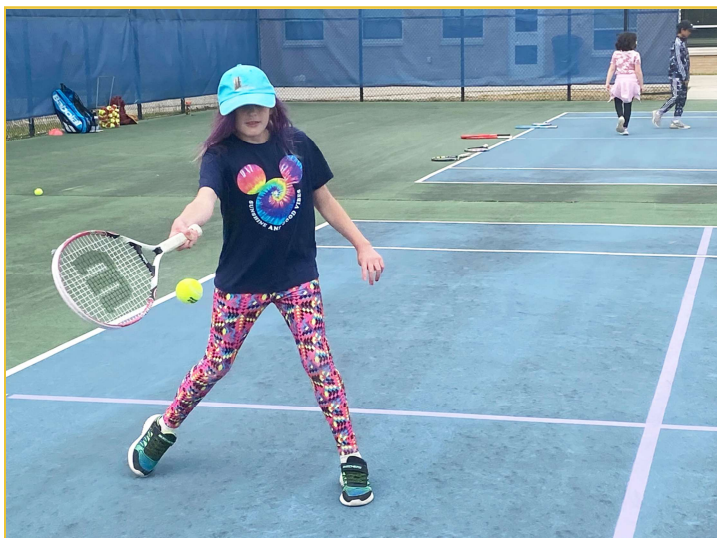
A Brown Deer player kept her eye on the ball during a drill last summer.

The bottom line is that by participating in Money Sense, the MTEF players not only learned about money management but also got a taste of the rewards that come with financial responsibility.