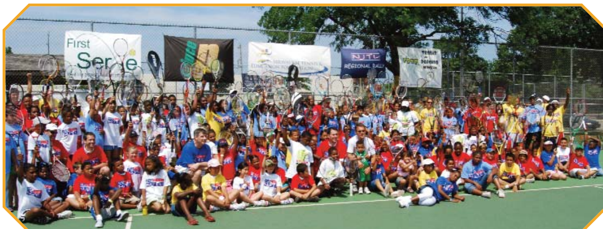
Participants and staff gathered for a group shot at the 2008 USTA/NJTL rally at Merrill Park. Among those in the second row were Milwaukee County Executive Scott Walker (center, red shirt) and the lead instructor, tennis pro Gene Mayer (white shirt next to Walker).