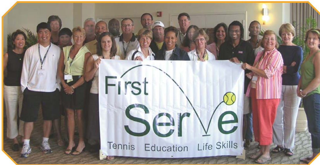
This happy group gathered at the Mary Ryan Boys & Girls Club at Sherman Park on the day in 2006 that MTEF officially became the second First Serve Chapter in the Midwest Section.