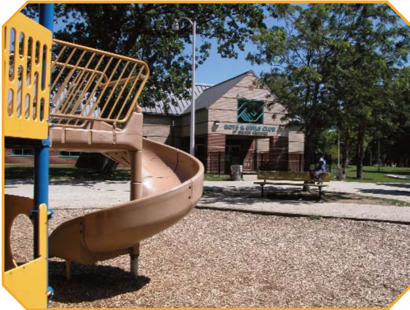
In the summer of 2006, MTEF moved its headquarters to leased space in the Mary Ryan Boys & Girls Club at Sherman Park.

MTEF was recognized as the USTA Midwest Section NJTL Chapter of the Year.