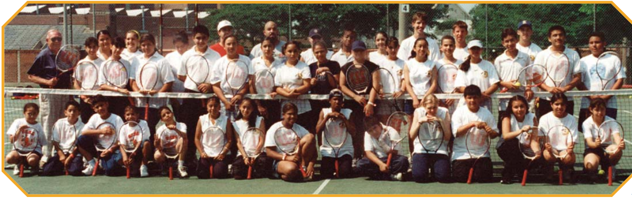
Staff and participants in the MATL summer tennis camp at Kosciuszko Park convened for a group photo in August 2001. Shortly thereafter, the program was renamed TEAM (Tennis, Education and Mentoring).