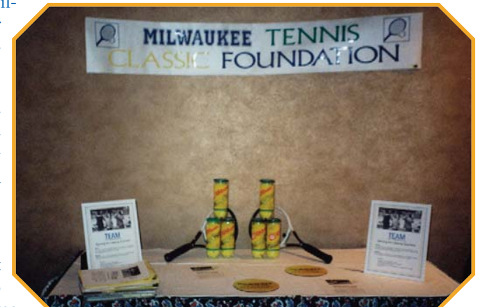
The initial funding that allowed the TEAM program to begin a rapid expansion came from a $31,000 grant from Potawatomi Bingo Casino's "Miracle on Canal Street" program. This was the foundation's display outside the casino's bingo hall in December 2001.