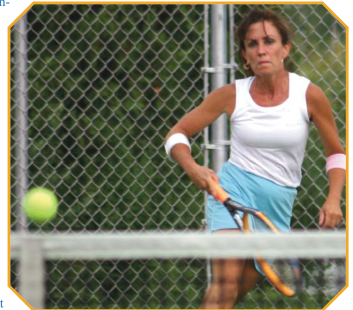
The Metro Milwaukee Adult League was formed in 2007 to offer citywide competitive opportunities for its participants.