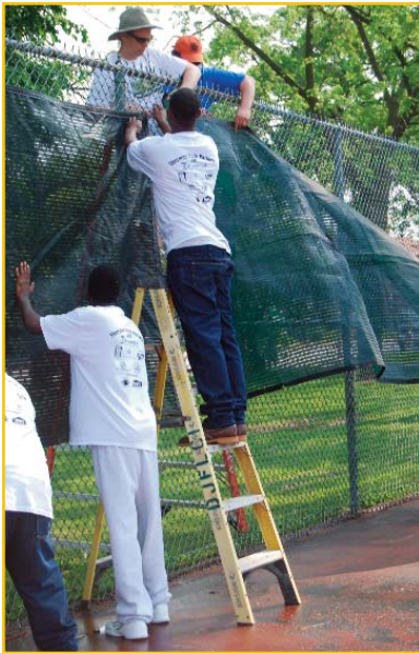
With gusts aplenty, it proved best to work from both sides when putting up the windcreens.