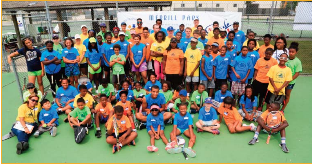
Staff and participants gathered for a photo at the 2016 NJTL Regional Rally at Milwaukee's Merrill Park.