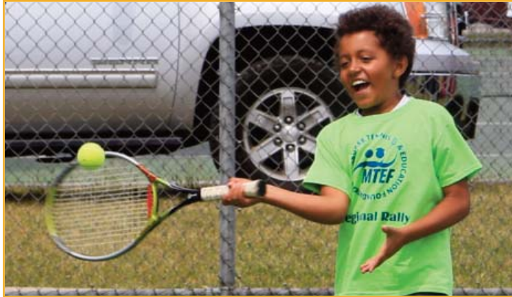
This youngster was an obviously enthusiastic participant at the 2016NJTL Rally at Merrill Park.