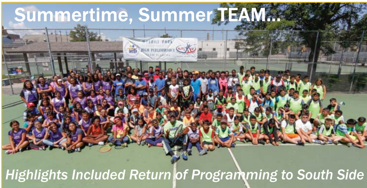
Participants and staff gathered for a photo at the 2017 MTEF/NJTL Regional Rally on July 28.