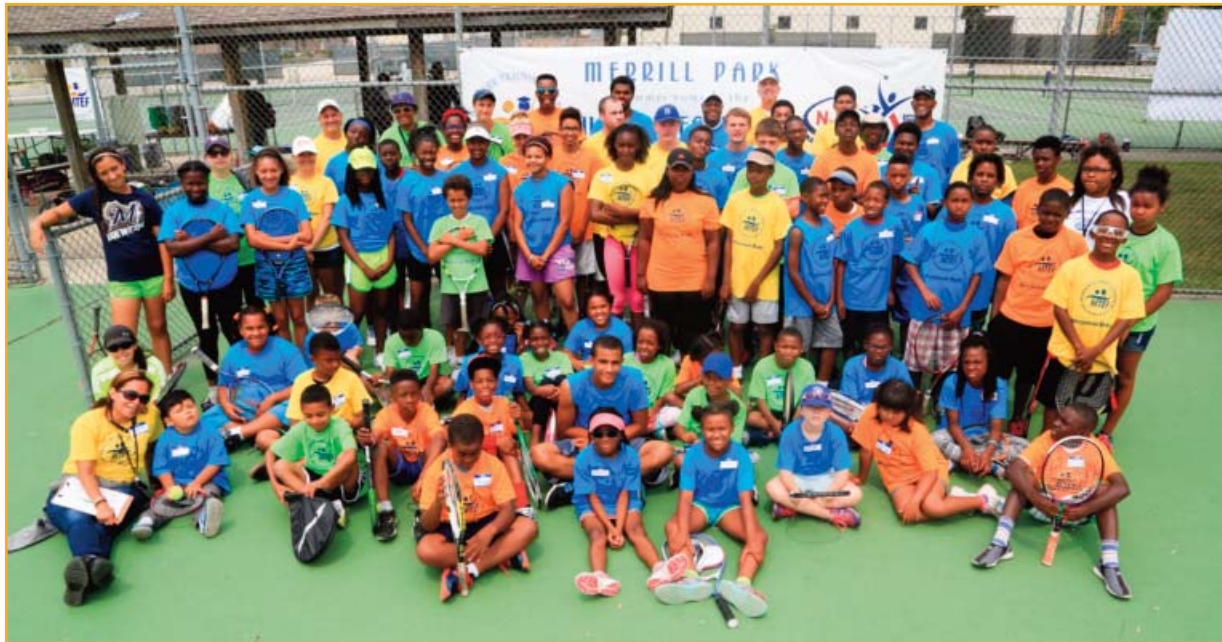
Staff and participants gathered for a photo at the 2016 NJTL Regional Rally at Milwaukee's Merrill Park.