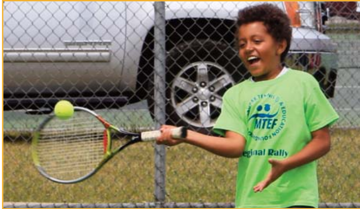
This youngster was an obviously enthusiastic participant at the 2016NJTL Rally at Merrill Park.